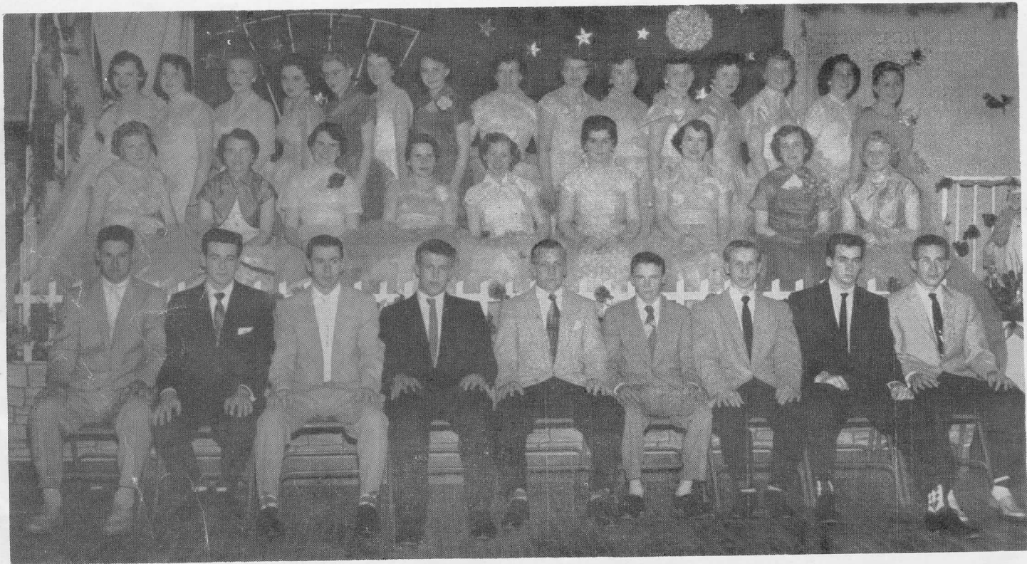
AT THE JUNIOR — SENIOR PROM