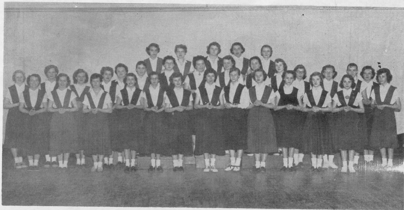
THE GLEE CLUB