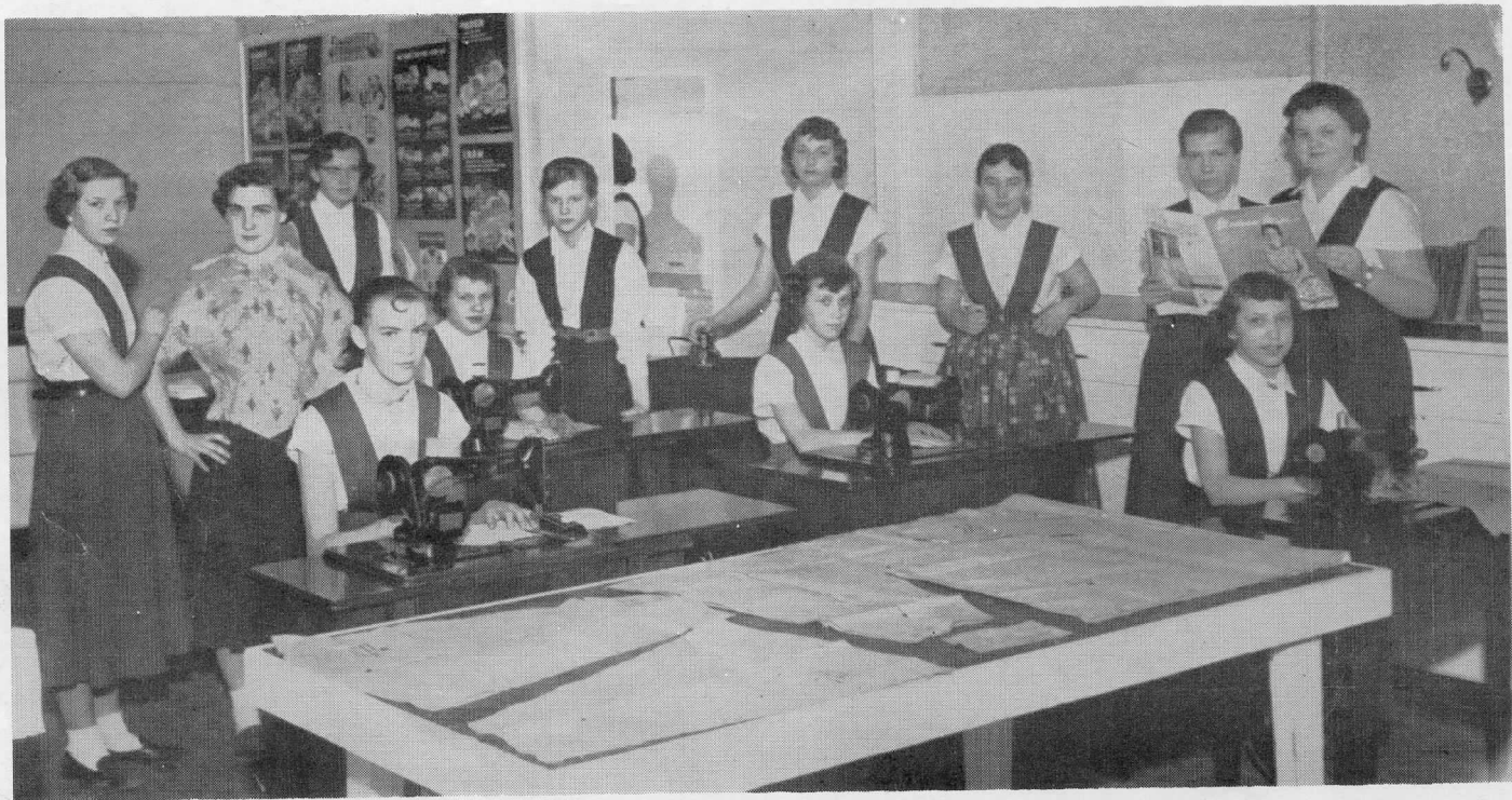
WE LEARN TO SEW