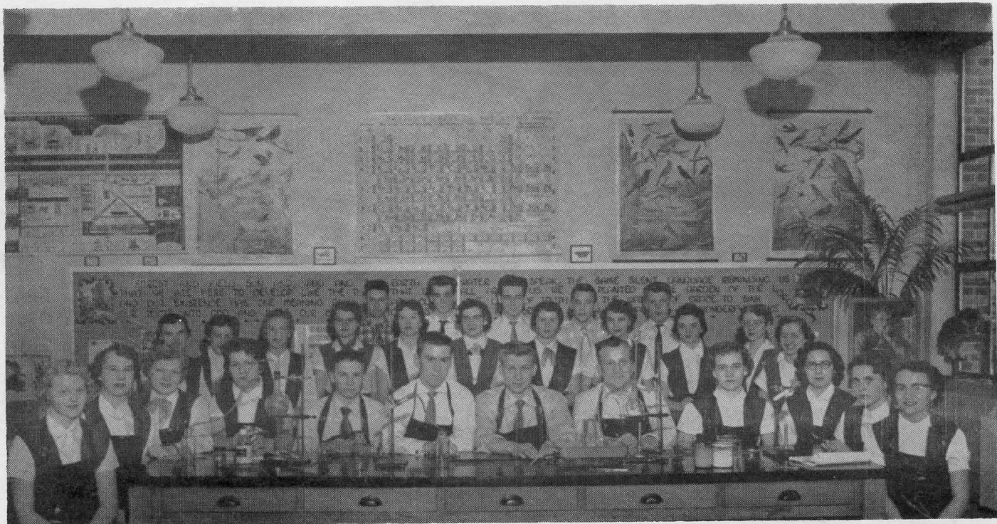
IN THE SCIENCE LABORATORY