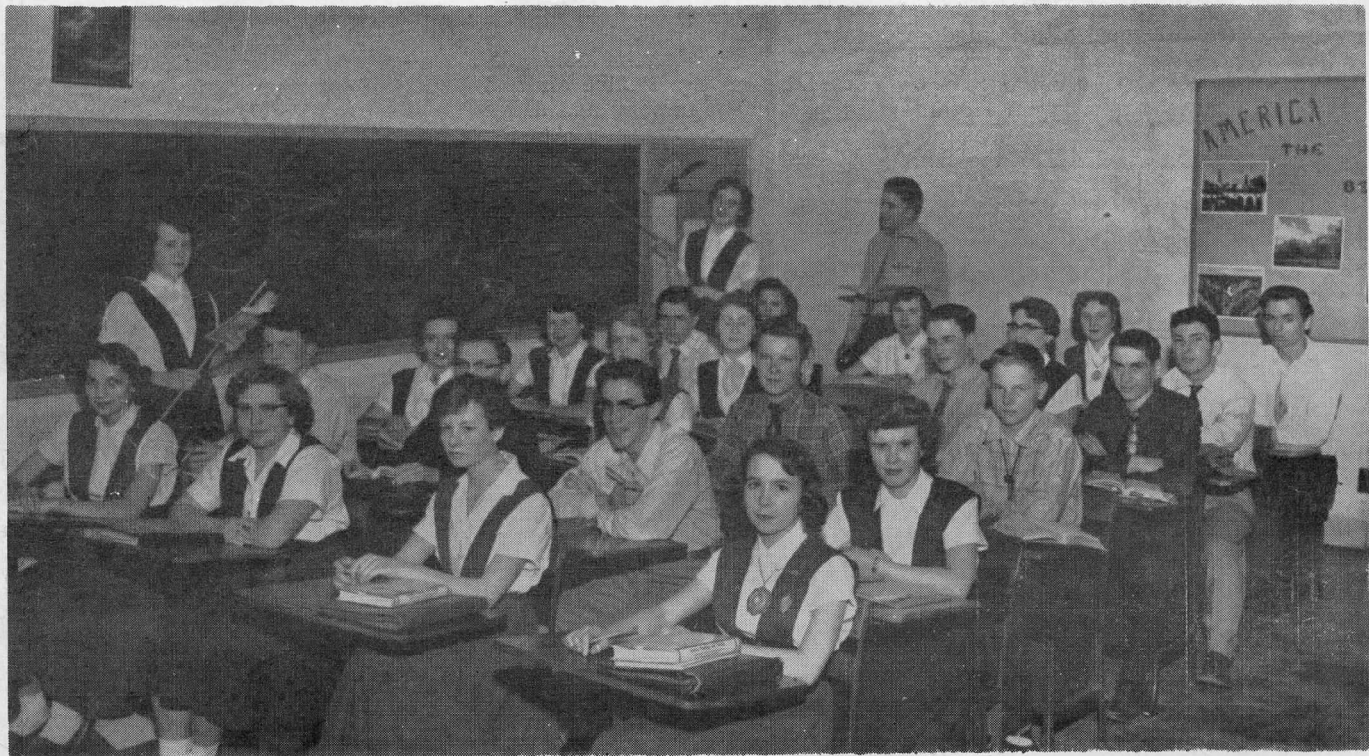
WE ENJOY GEOMETRY