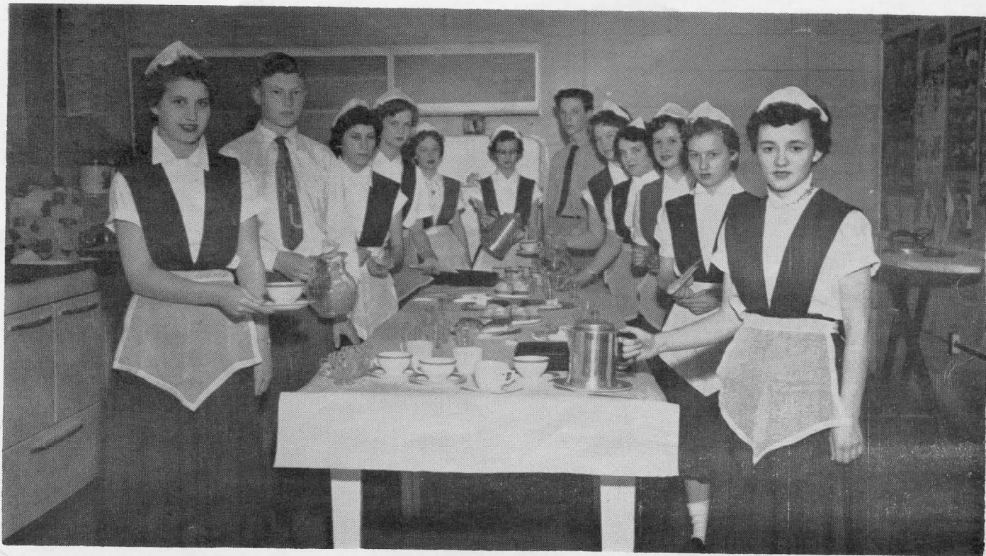
WE LEARN TO COOK