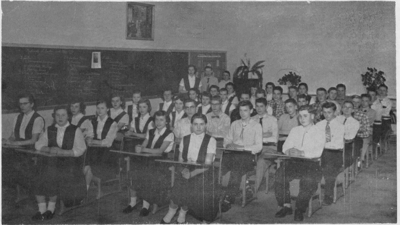
CLASS ROOM SCENE