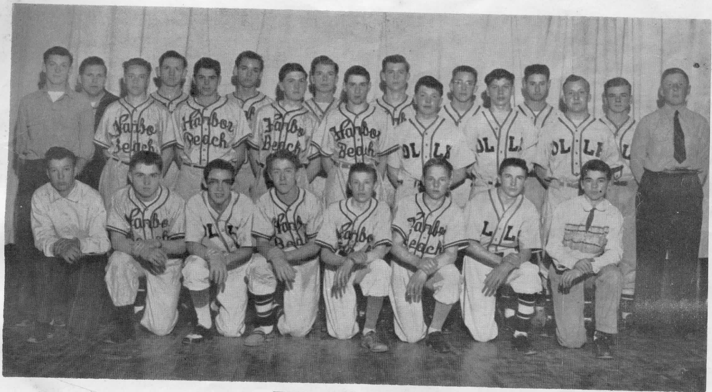
THE FIRST TEAM