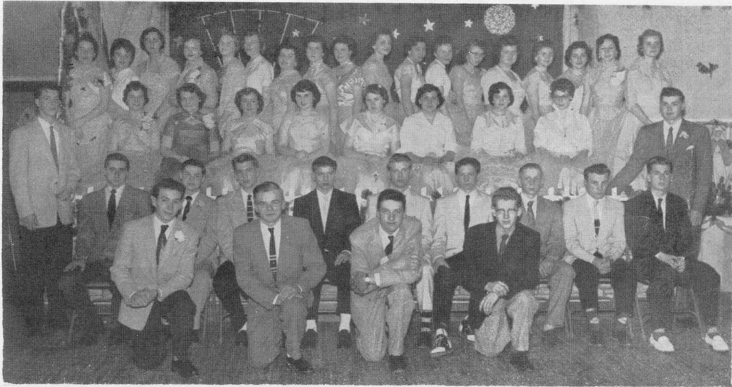
AT THE JUNIOR — SENIOR PROM