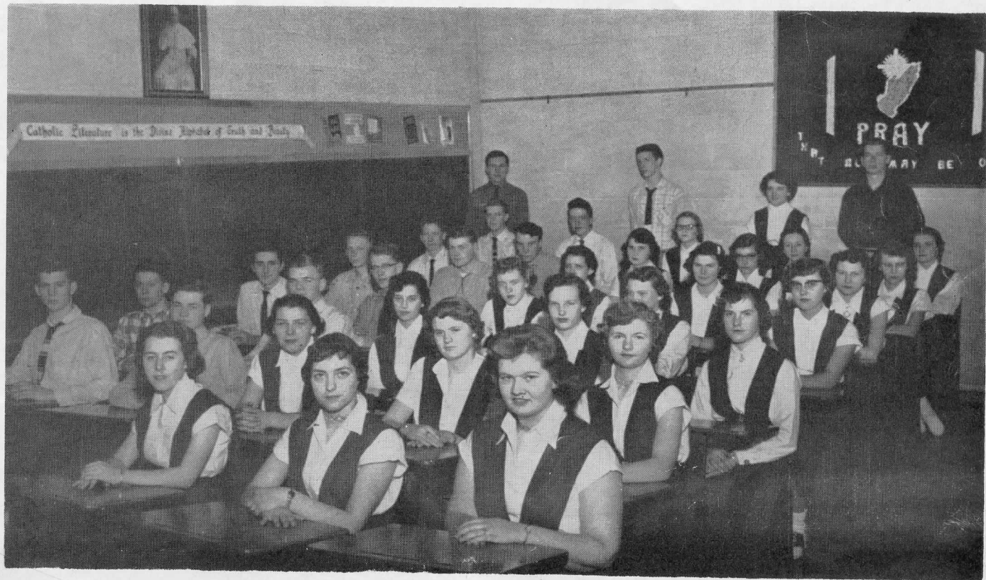
CLASS ROOM SCENE