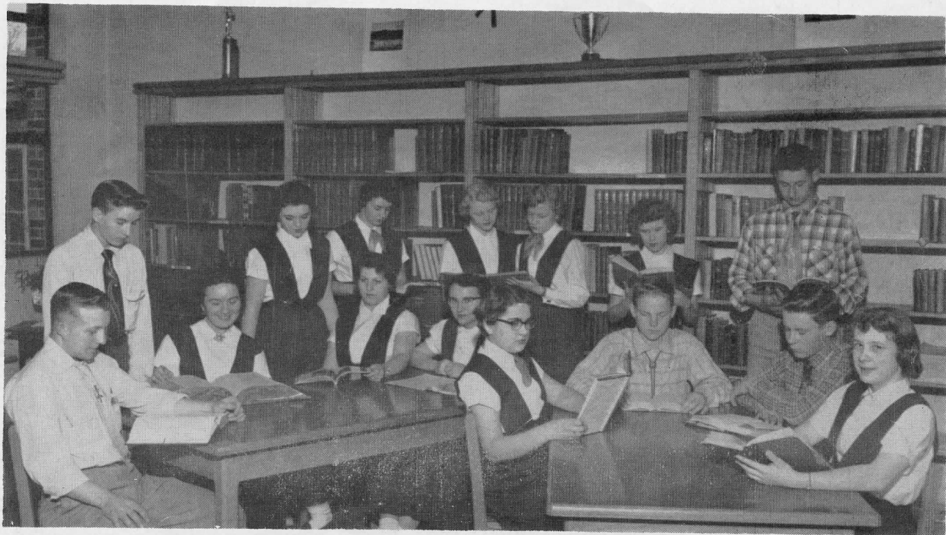
ENJOYING NEW BOOKS