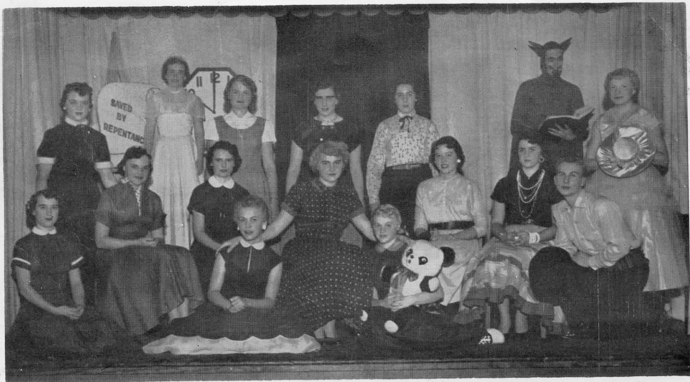
SCENE FROM SENIOR CLASS PLAY