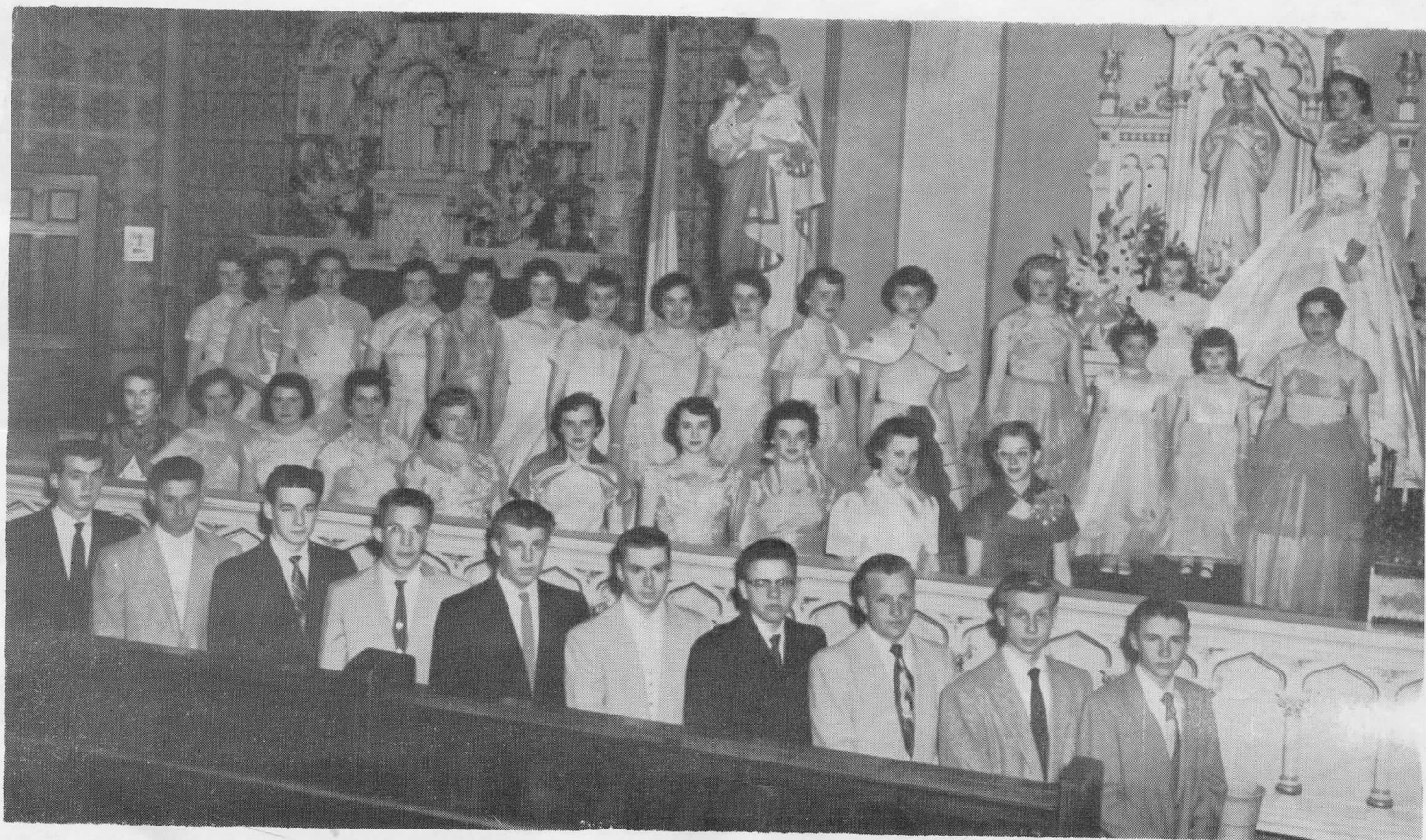
THE MAY CROWNING